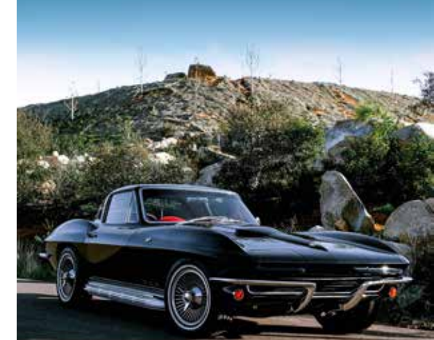
LOT #735 - 1965 CHEVROLET CORVETTE CUSTOM COUPE