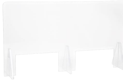
5'10" x 42"H