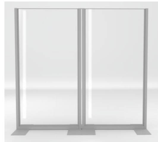
78"L x 72"H

** The above items are samples only and quantities are limited. Please call for details and availability.