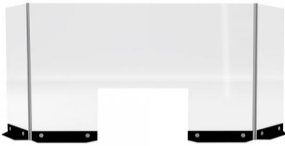
48"-70"W x 31.5"H

Table Top Dividers - Expanding Clear Divider, Acrylic Screen with 2 Cutouts, Acrylic Screen w/ Narrow Cutout