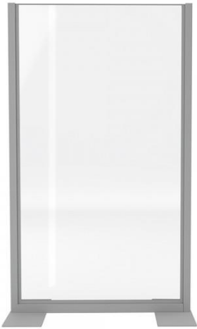
39"L x 72"H

Freestanding Floor Dividers - Single Divider, Corner Divider, Wall Unit Divider