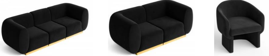
Red Colette Fabric Collection - Sofa, Loveseat & Chair (Also Available in Ivory)